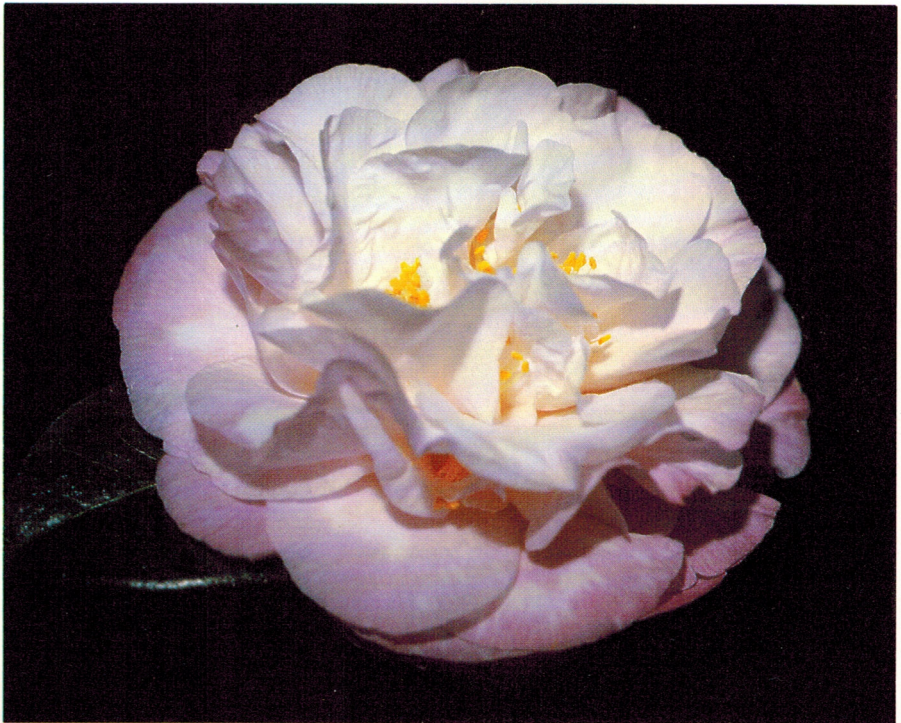
'Tomorrow Park Hill'

A Publication of the Southern California Camellia Society